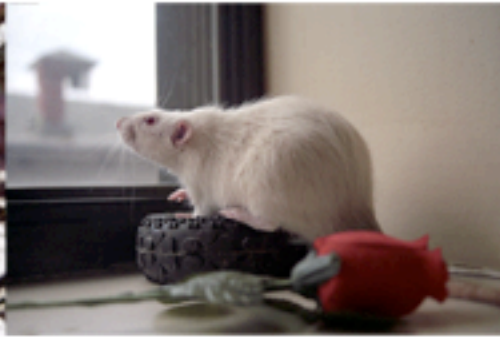
Beth Klaus, 2008